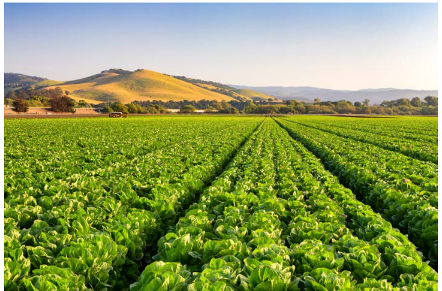
Salinas, California – known as the “salad bowl of the world” – is quickly transforming into a global hub for AgTech.

Despite its stature as an agricultural powerhouse, Salinas faces many challenges. Educational attainment is low: only 60 percent of the city’s population has a high school diploma, and just 12 percent