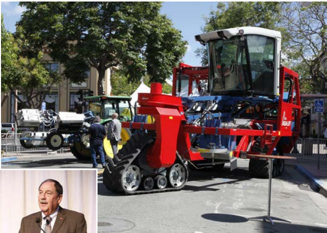
Above: Farming equipment on display during the Forbes AgTech Summit on Main Street in Salinas.