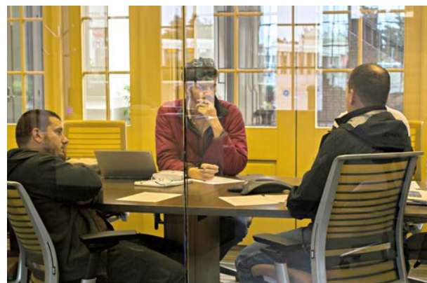
Salinas' Western Growers Center for Innovation & Technology offers workspaces and collaborative opportunities for agtech entrepreneurs.

spaces and collaborative opportunities for agtech entrepreneurs.