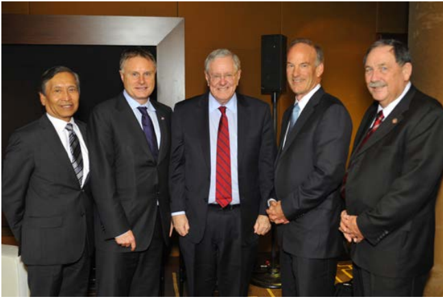
Salinas leaders meet with Steve Forbes in New York City

Valley and global agriculture to tackle some of the world's most critical challenges in the agriculture industry. The first summit was such a success that Forbes made it an annual event and continued to hold its AgTech summits in Salinas in 2016 and 2017.