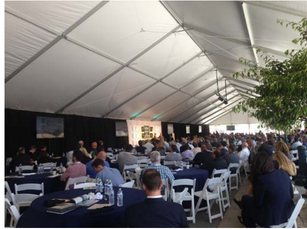
The Forbes AgTech Summits have put Salinas in the national spotlight.

In the case of Salinas, where the fertile valleys have inspired Steinbeck novels and led to breakthroughs in the agriculture industry during the past century, it was important to stay true to the city's roots, while also being forward-thinking. City leaders made the strategic decision to build upon Salinas' existing strengths in agriculture and proximity to Silicon Valley to focus on AgTech, putting their resources towards developing their stron-